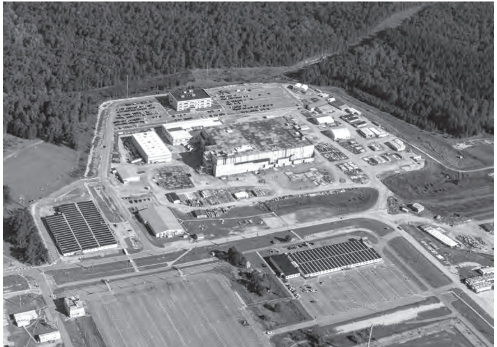
The plutonium fuel MOX factory is officially terminated after billions of dollars were squandered on half-baked designs and substandard parts for over a decade. Now the National Nuclear Security Agency, NNSA, is proposing to make plutonium nuclear weapons pits in the abandoned building.

Frankly, the plutonium in South Carolina is not suitable for MOX plutonium fuel or plutonium pits or anything. It is waste. Deadly waste.