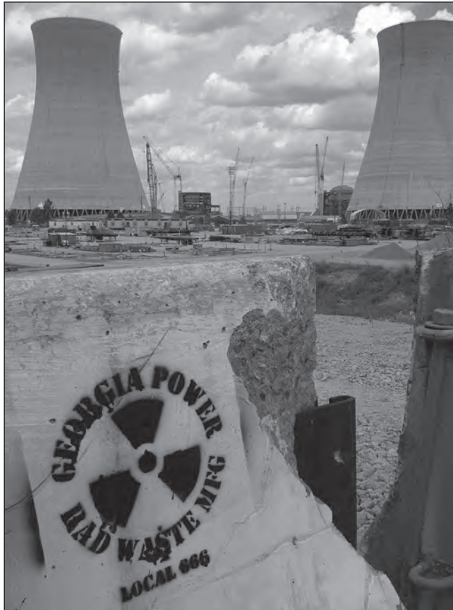
Vogtle 3 & 4 construction March 2019.

But why would elected officials like the Public Service Commission give their rubber-stamp of approval to a utility selling its customers something they don't need and can't refuse, at an undeserved profit?