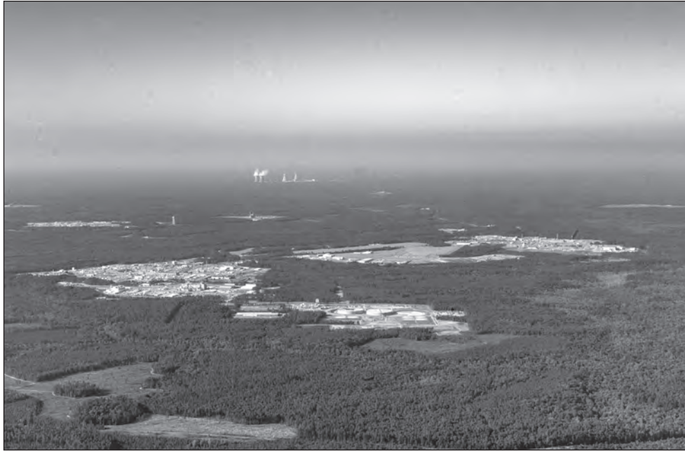
Georgia Power's Vogtle Nuclear Plant cooling towers are visible from Savannah River Site in South Carolina. The terminated MOX factory site is in the foreground at the far right.

"It is stunning to realize that perhaps $40 billion has been spent so far on the three sites, with the cost at all of them going up daily, money that should have been spent on