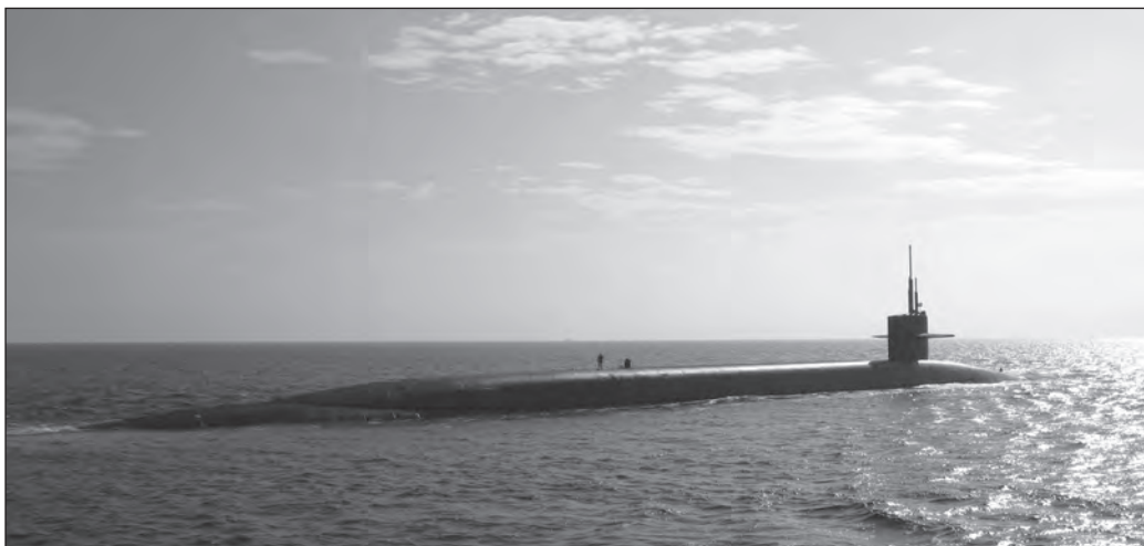
Six Trident submarines are homeported at Kings Bay, St. Marys, GA. Each nuclear-powered submarine carries nuclear-armed D5 missiles with the explosive power equivalent to 1,825 Hiroshimas.