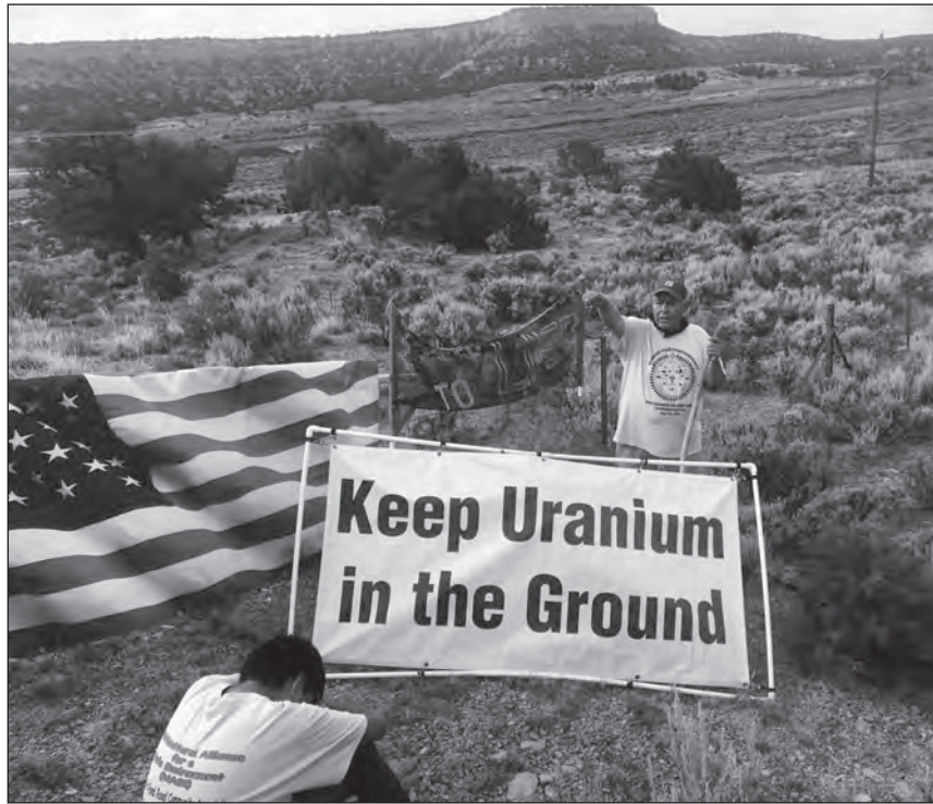
Larry King worked at the Church Rock uranium mine before and after the spill.

The gathering began at 7:00 AM with a healing ceremony for the land, water, people, all life. Over 100 people, former miners, grandparents, and children of the community, supporters from as far away as